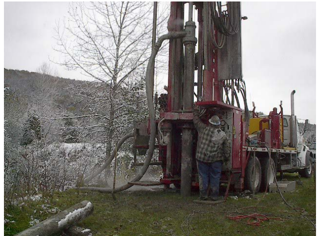
Figure 2. Drilling for a Vertical Loop System

After system installation, R.E.A. will document the efficiency of the system, prepare an as-built report and assist with any applicable incentives and/or tax credits related to GSHP system.